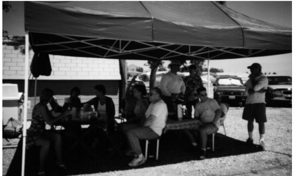
The club's new EZ-Up tent attracts an enthusiastic crowd to July's BBQ at Hemet.